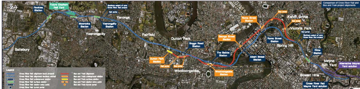
Cross River Rail